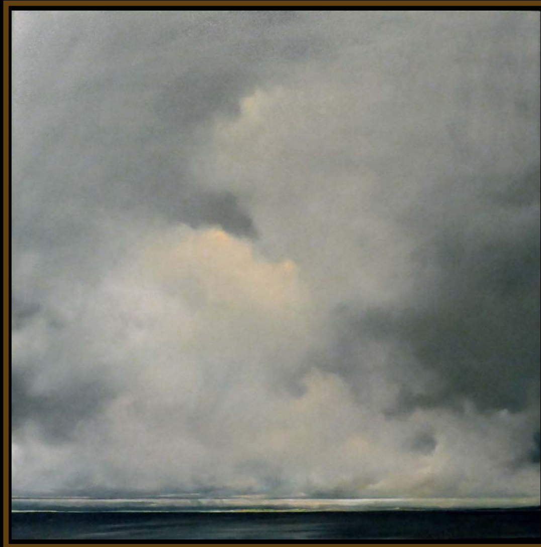
Ripe for the Ringing

[ "I'd be happy just stand and watch the big weather come in... stand in the storm and feel the earth ring." - Once Wild Horse ] Oil on Canvas - 48x 48