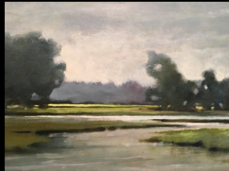
Deeper Than Expected [ Pushing in... Near Mantanzaz, Cuba.] Oil on Canvas - 36x24