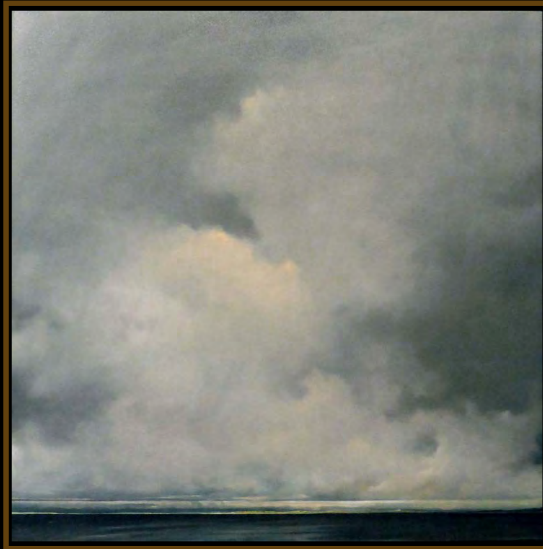
Ripe for the Ringing

[ "I'd be happy just stand and watch the big weather come in... stand in the storm and feel the earth ring." - Once Wild Horse ] Oil on Canvas - 48x 48